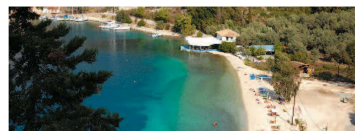
Beach below Spartochori

Self Catering Apartments for Air Conditioning Free WiFi